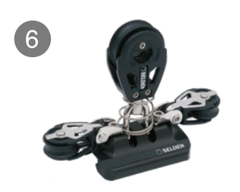
Car with block and control block