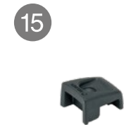
15 End cap