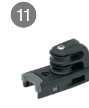
11 End control