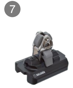
7 Self tacking jib car