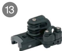
13 End control, cam cleat, starboard