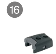
16 End stop