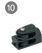
10 Genoa end control