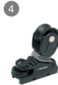
4 Genoa car