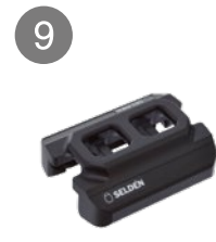
9 Tie-on car