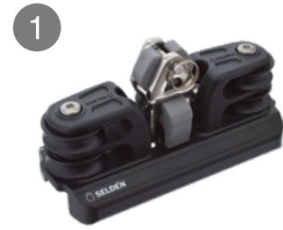
1 Main car

Seldén system 22 is used for keelboats and yachts up to approximately 33'. See all combinations at pages 74-75 and 78-79. For more information about dimensioning, see page 104.