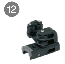
12 End control, cam cleat, port