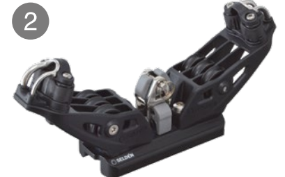
2 Main car with cam