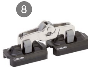
8 Double self tacking car