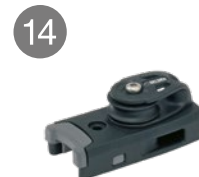
14 End control with cheek