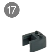
17 High beam adaptor