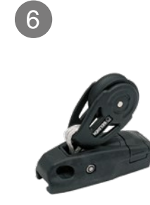
6 Jib car for use on Keelboats