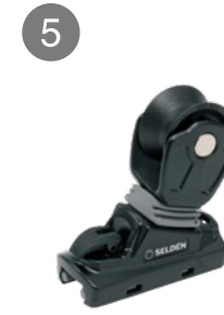
5 Genoa car, pinstop